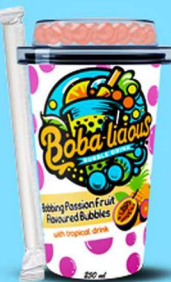
PASSION FRUIT BUBBLES WITH TROPICAL DRINK