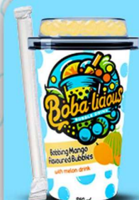
MANGO BUBBLES WITH MELON DRINK