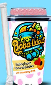
PEACH BUBBLES WITH STRAWBERRY DRINK