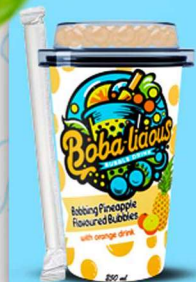
PINEAPPLE BUBBLES WITH ORANGE DRINK